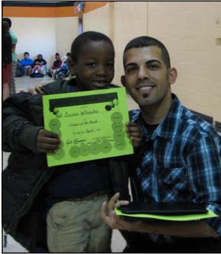
Devon — Kindergarten