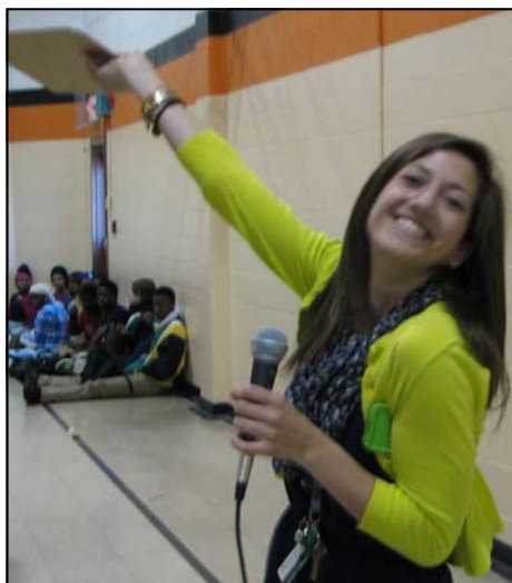
English Language Arts