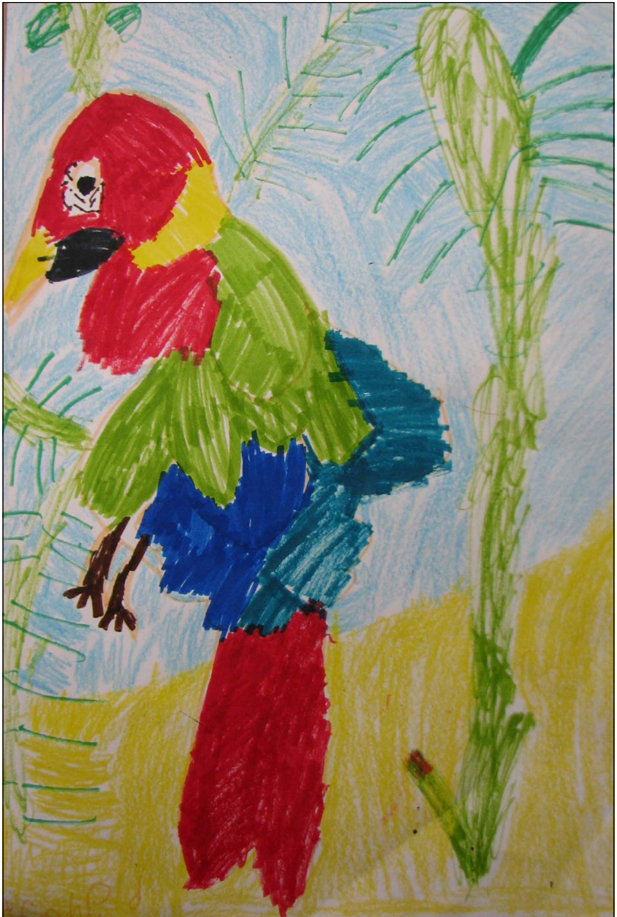
Armhed Story — KG — McCaw — Drawing