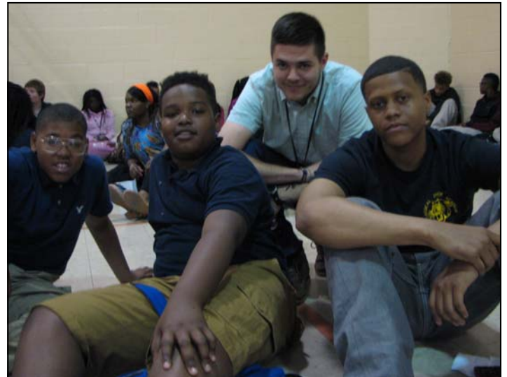
Parting shots from the Spring Concert