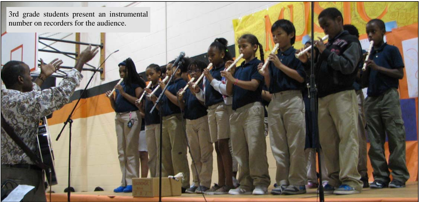
3rd grade students present an instrumental number on recorders for the audience.