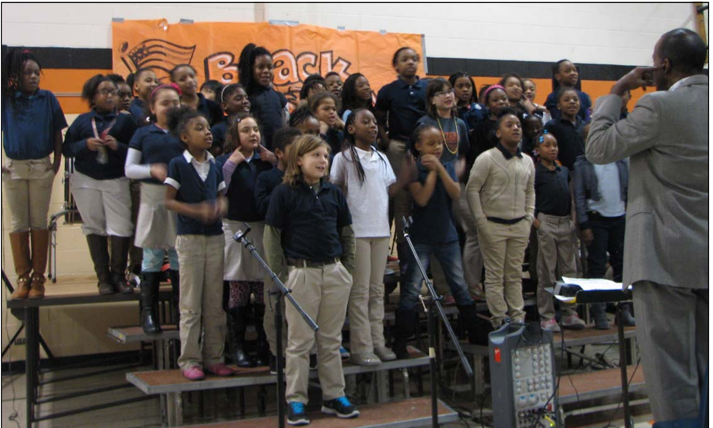
Third Grade students perform on February 27, 2015