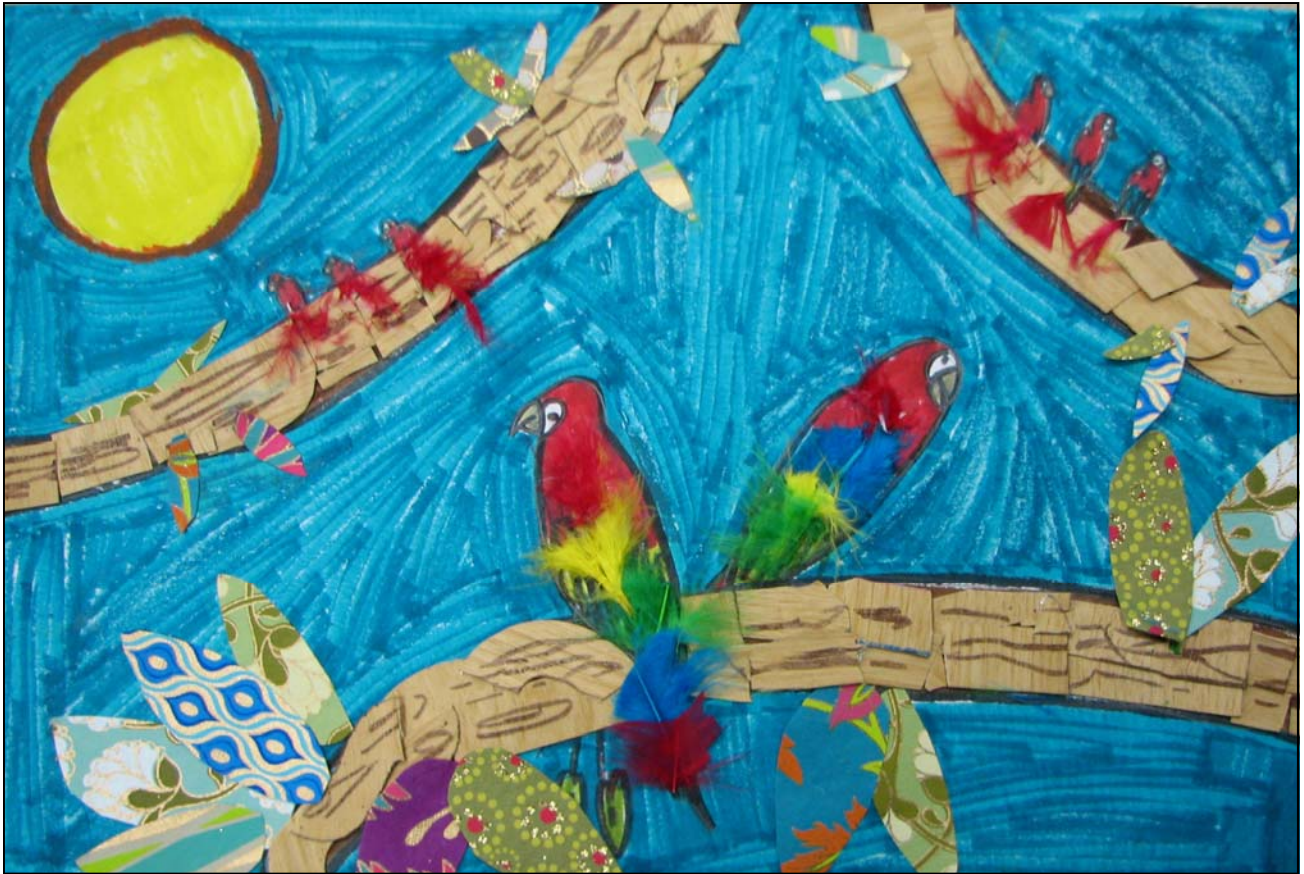
Brooke Bradford — 3rd — Birds — Mixed Media