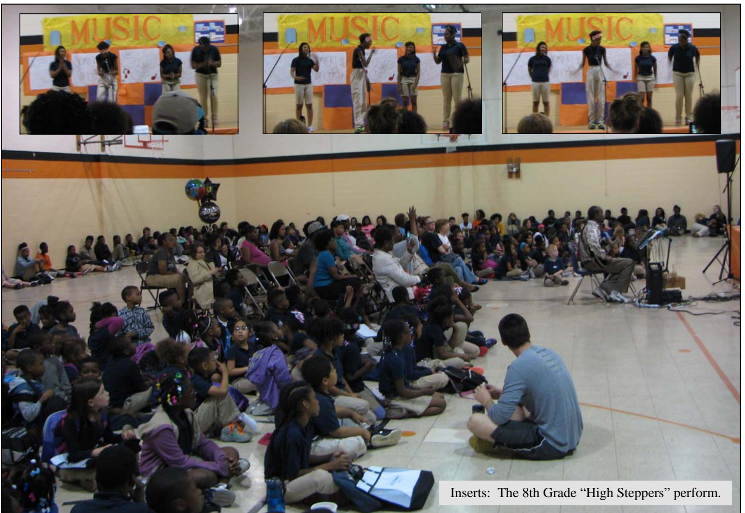
Inserts: The 8th Grade "High Steppers" perform.