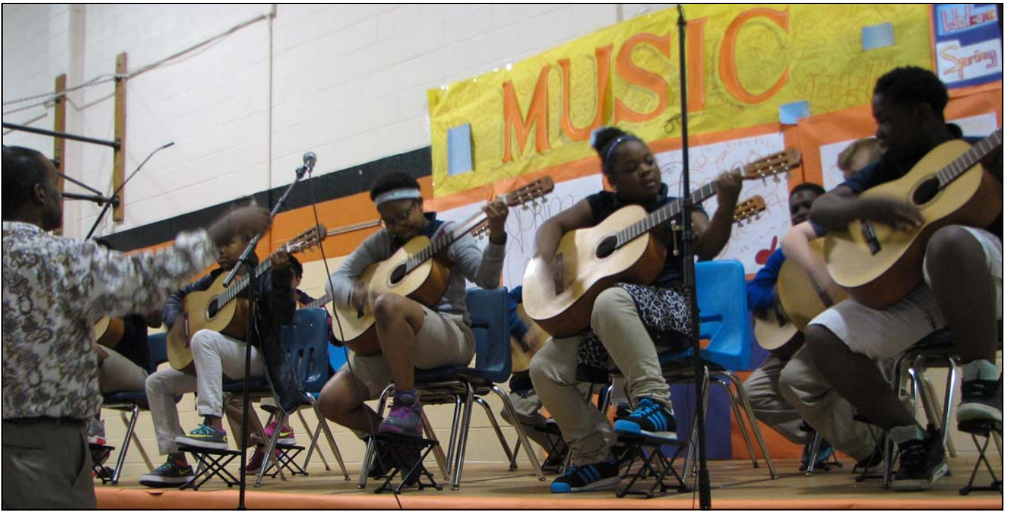
The 6th grade guitar ensemble plays a number on guitars generously donated to Lyon Academy by the St. Louis Classical Guitar Society. The students in this group spent extra time, outside of the school day, practicing on the classic guitars at home.