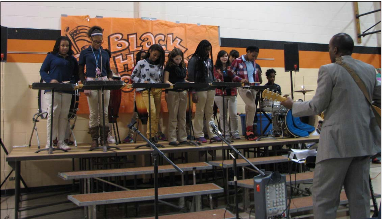
More music from the Sixth Grade Students!