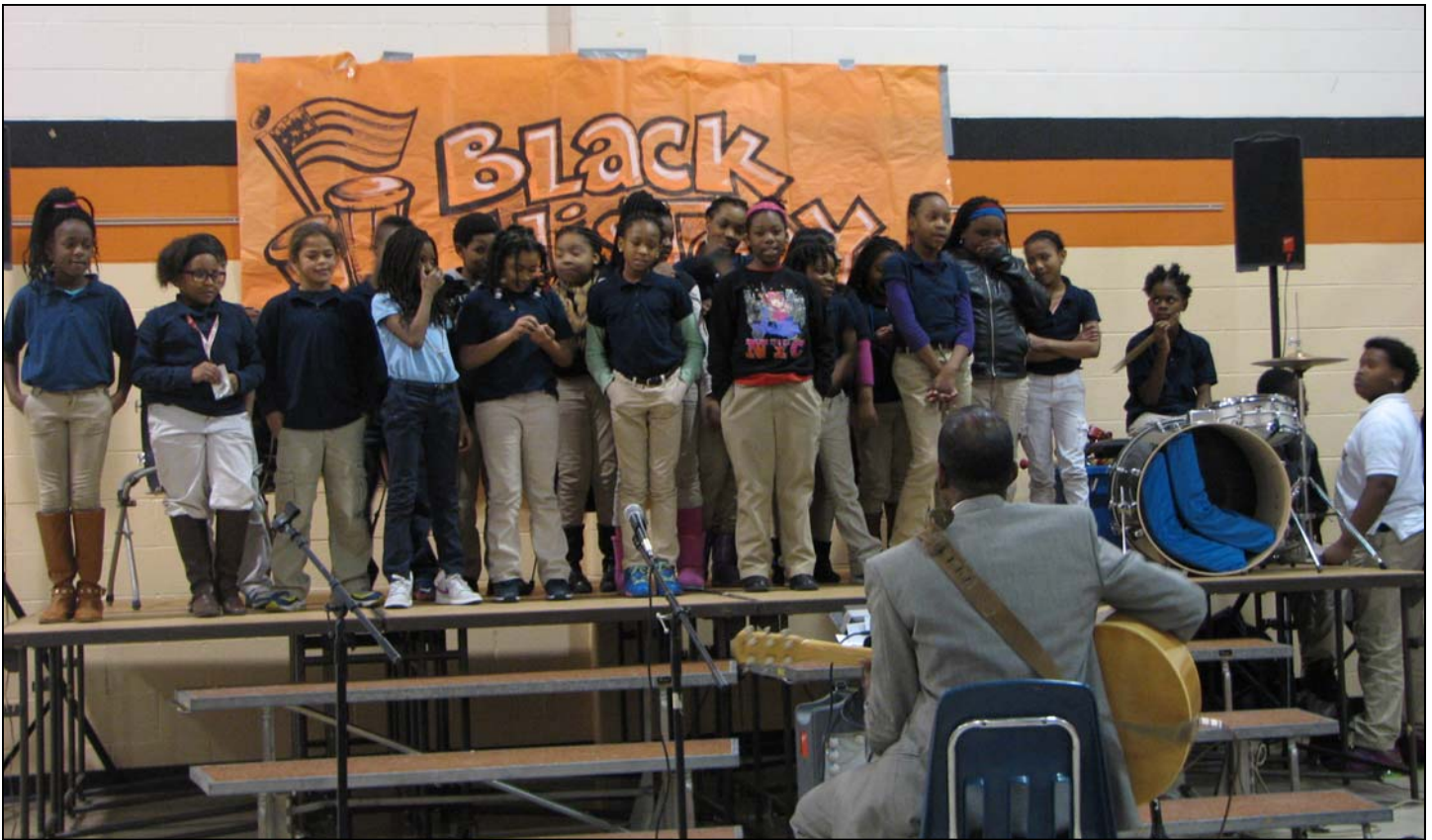
Fourth Grade students perform on February 27, 2015